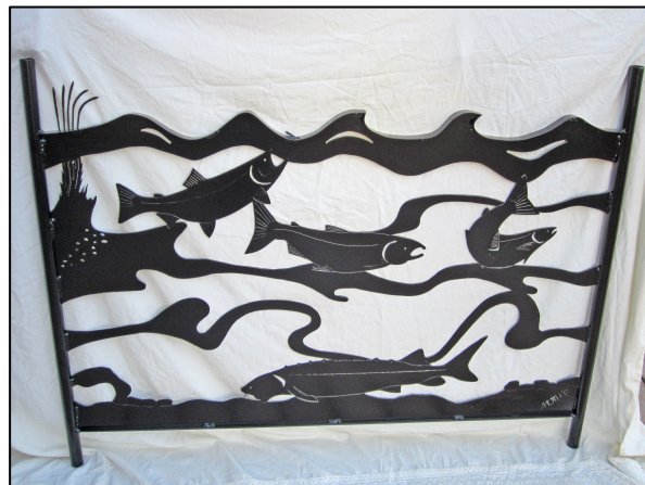
Salmon headboard/wall panel

I'd be very happy to answer questions or share experiences with anyone who may be interested in trying some metal art projects. Just send an email to amothfam@proaxis.com .