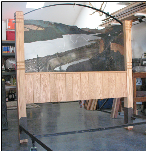
Columbia River Gorge headboard