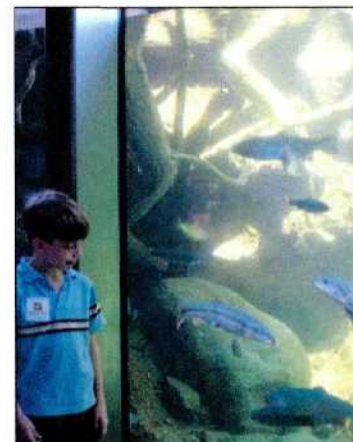
A young visitor marvels at native fish species within the 22,000-gallon Turtle Bay Museum aquarium.