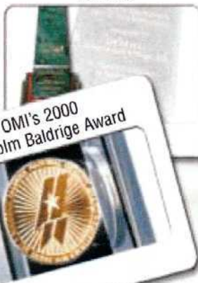
OMI's 2000 Malcolm Baldrige Award