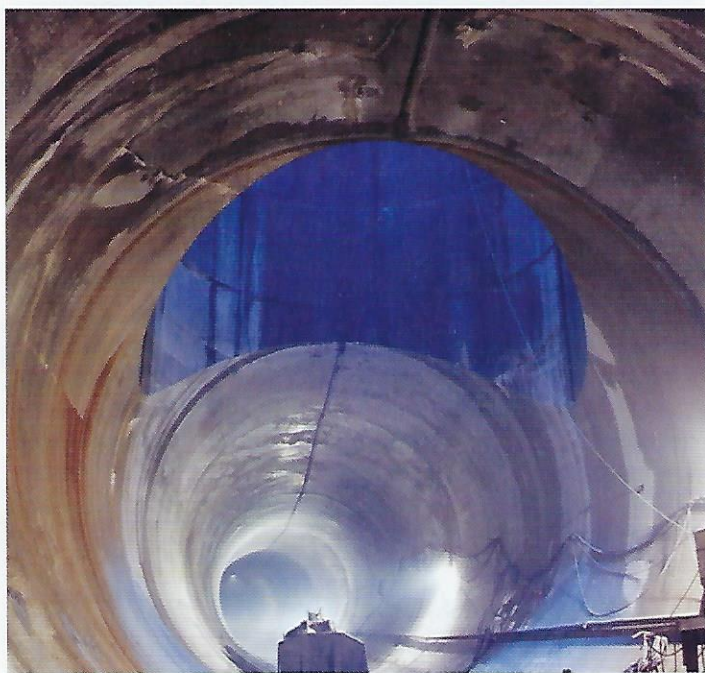
Milwaukee's deep tunnel system includes 19.4 miles (31 kilometers) of tunnels at up to 300 feet (91 meters) underground. The tunnels, along with the sophisticated control system made Milwaukee a national leader in the collection and treatment of stormwater and sewer overflows.

The Milwaukee Water Pollution Abatement Program served as a catalyst for CH2M HILL's future program management services.