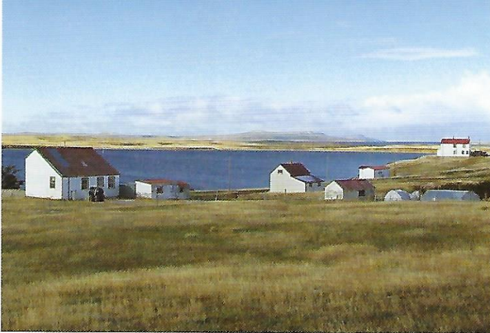
Port Louis is one of many rural settlements that will benefit from CH2M HILL's new project to overhaul the communications network serving the more remote areas of the Falkland Islands.