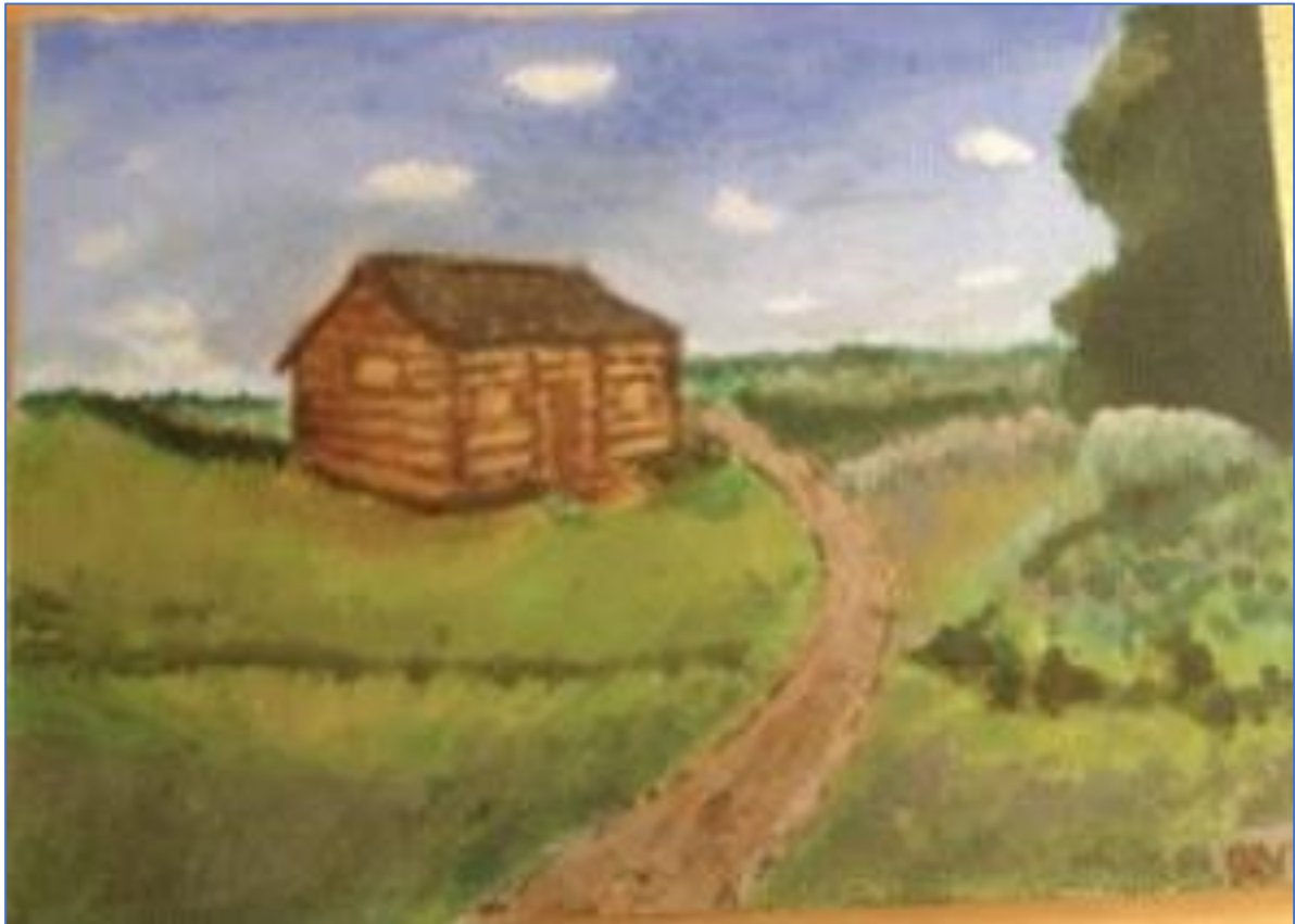
Farm with Cabin

Here are photos of some of my initial paintings: