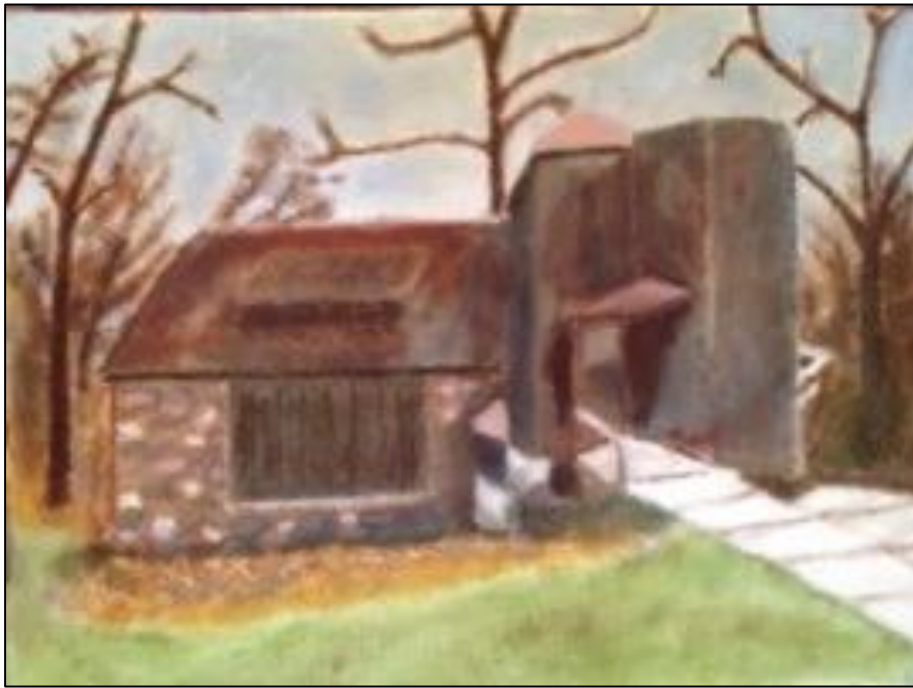
Wharton Esherick Museum