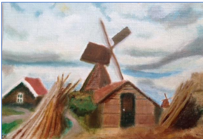
Kinder Dijk Windmill – Historic site