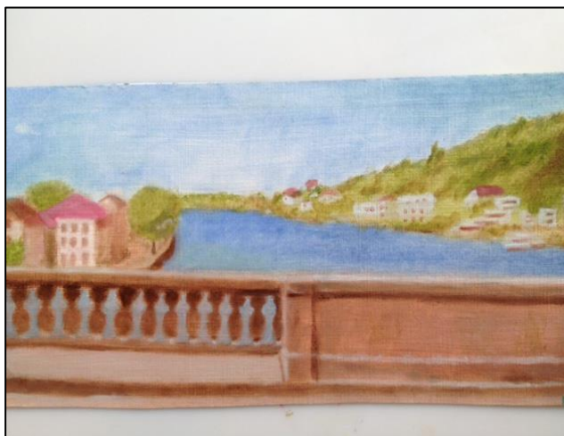
Neckar River, Heidelberg