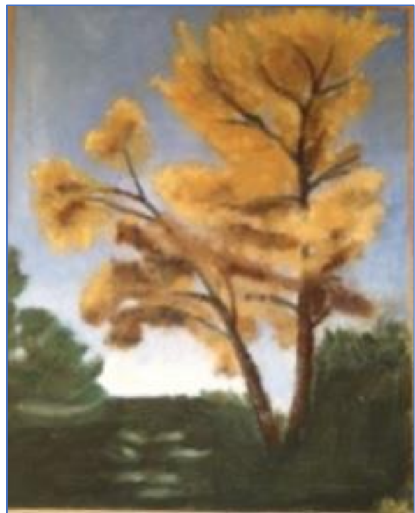
Paoli Battlefield in November