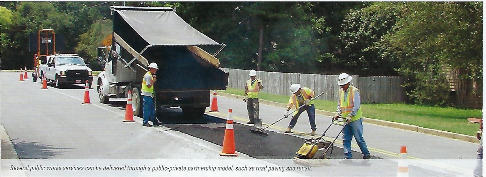
Several public works services can be delivered through a public-private partnership model, such as road paving and repair.