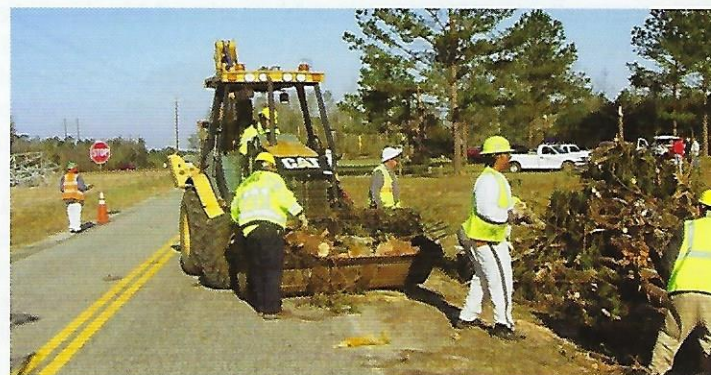
CH2M HILL OMI began providing public works services to cities in the 1990s. Here, employees working in Effingham County, Georgia, clean up after a tornado earlier this year.

For more information about CH2M HILL OMI's public works services, and a copy of its public works ad, visit www.omi.ch2mhill.com/communities/pw.html .