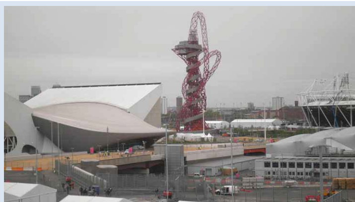
2012 London Olympics area

The next part of our journey took us by airplane from Dublin to Edinburgh, Scotland, for 3 days. While in Edinburgh, we toured the Edinburgh Castle; saw the botanical gardens near the pier where Queen Elizabeth's ship, the Britannica, is retired; and had lunch one day at Scotland's oldest pub, Deacon Brodie's Tavern.