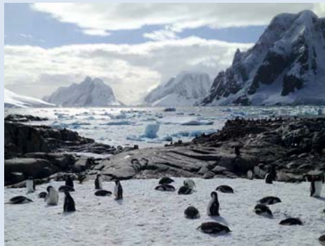
The spectacular scenery of Antarctica

due south to Ushuaia, the southernmost city on the planet. From there we boarded the MS Fram for an 18-hour sail across the Drake Passage to the Antarctica Peninsula. We were told the sail was pretty calm with only 3- to 4-meter swells. We spent 8 days sailing further south through the Peninsula, ending up at the Antarctica Circle (66 2/3 S. Lat.) before finally turning north. Each day included two "landings" where we left the ship via zodiac-like boats to set foot on land and glacier. Each day presented itself with spectacular scenery and an amazing diversity of wildlife including birds, whales, seals, and the not-so-wild penguins. The weather was surprisingly mild with temperatures a consistent 32 to 35 degrees F. On our return crossing of the infamous Drake, we experienced a more normal rock 'n roll ride of 8- to 10-meter swells. Surprisingly, we all survived with no "ill" affects. ☺