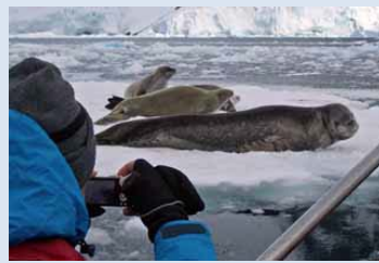
Some of the wildlife of Antarctica, Leopard seals

I am often asked, "Why in the world Antarctica?!" In short, it is beautiful, wild, and immense ... it has to be seen to be believed. It was indeed the trip of a lifetime and I would go back in a heartbeat."