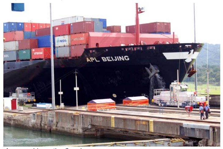
A cargo ship on the Canal