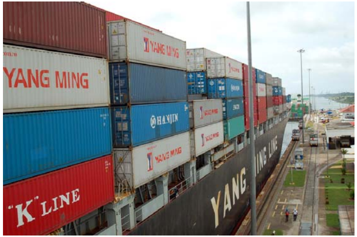
Cargo moves through the historic Panama Canal, built in 1914

Our boat is passing through the Gaillard Cut. We are using one of the Panama Canal Authority (our customer's) boats to travel the length of the Canal to review the ongoing demolition, widening and deepening of the ship path-way. It is about 30 degrees Celsius and humid. Typical day at 9 degrees north of the equator. We have just docked to take a four-wheel site visit where our contractors are lowering the top of a mountain, in preparation for the excavation of the new canal path starting in late 2008.