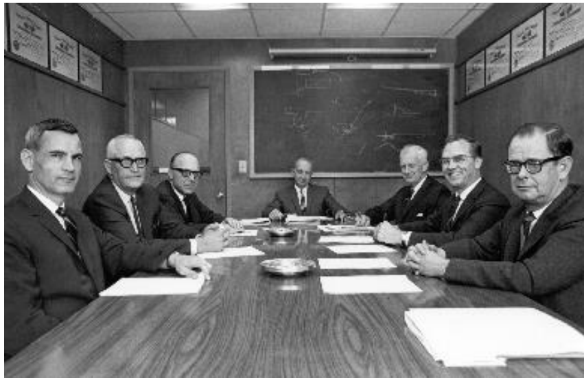
An early board meeting, abt late 60s.