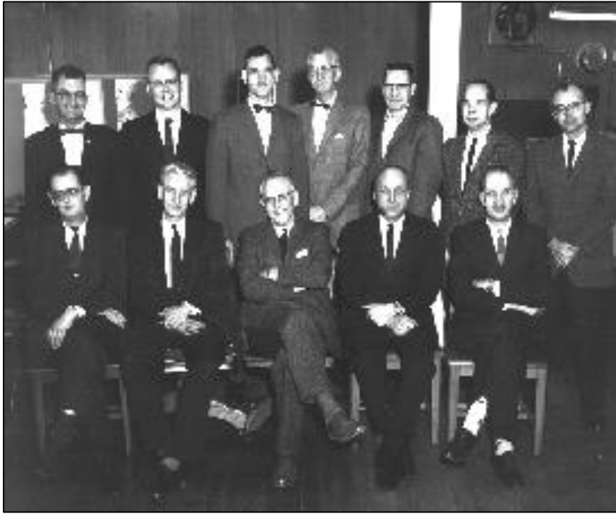
The Boys .. abt 1960s.