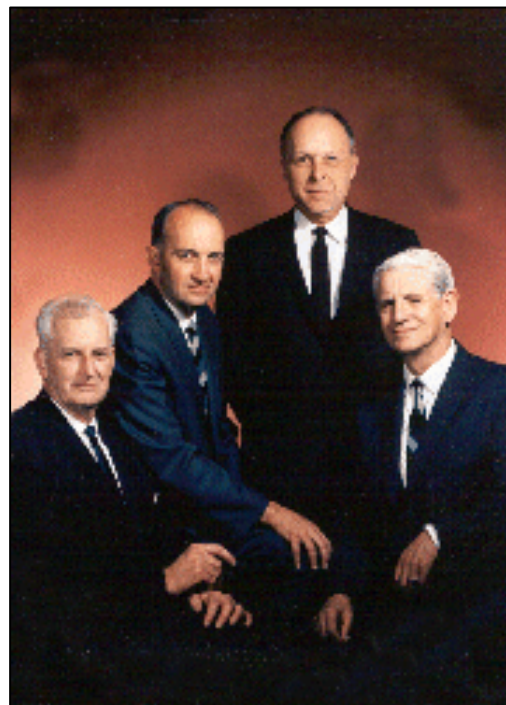
The Founders, abt early 60s.